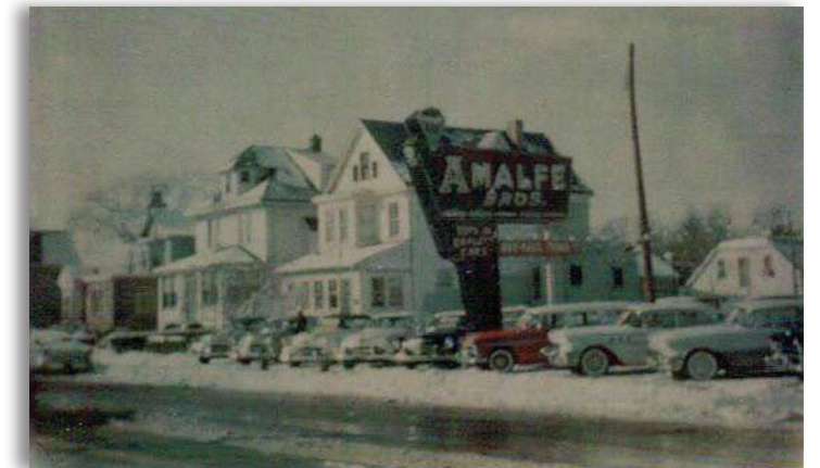
1950: Amalfe Bros. Used Car Sales opened in Elizabeth, NJ

Privately held, Momentum USA, Inc. remains a solvent and profitable entity and reinvests in all of its divisions to ensure sustained growth. Momentum continues to expand its market share and lead in each of its three core competencies: brake pads, filtration and exhaust products.