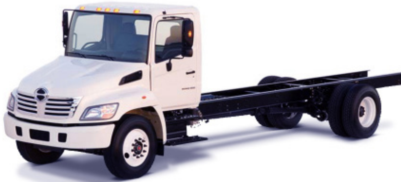
MED DUTY SAE J2684

TOLL FREE: (866) 272-8330 • CUSTOMER SERVICE DIRECT: (804) 329-3077